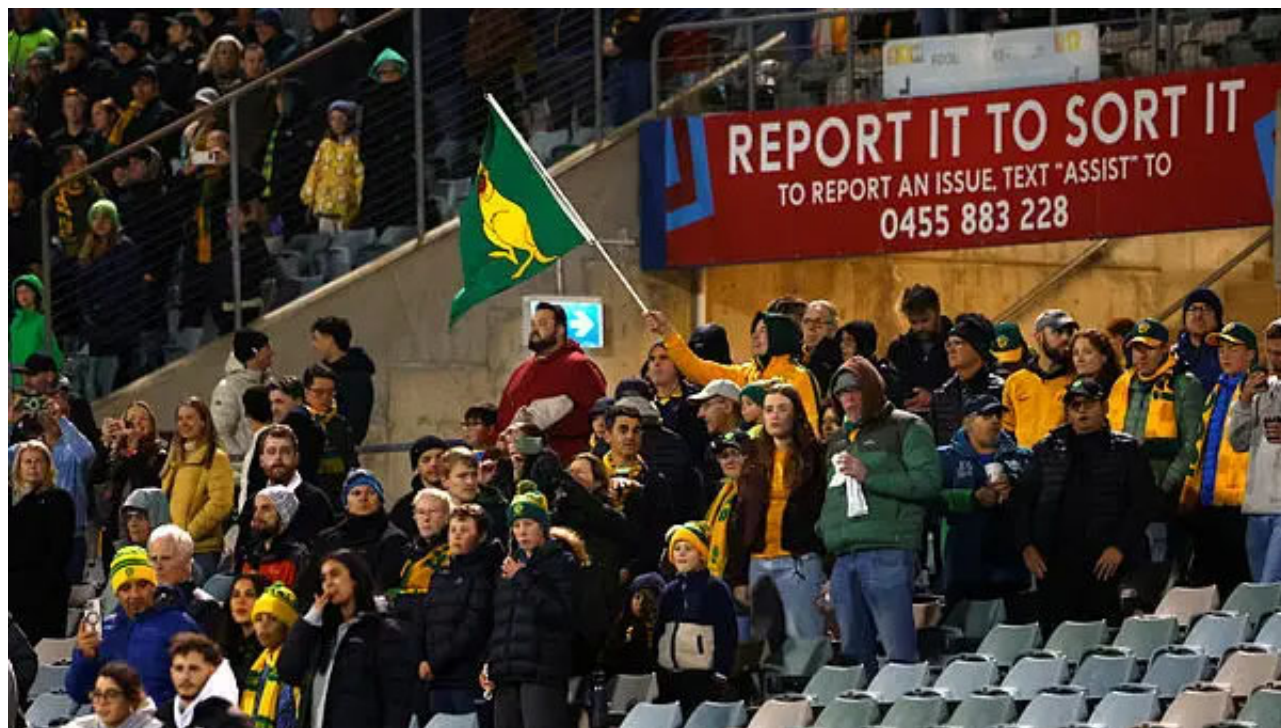
📷 Australia fans cheer on the Socceroos in a friendly against the New Zealand All Whites on Sept. 5, 2025 at GIO Stadium.

limited to two drinks a match, and no liquor will be allowed after halftime.