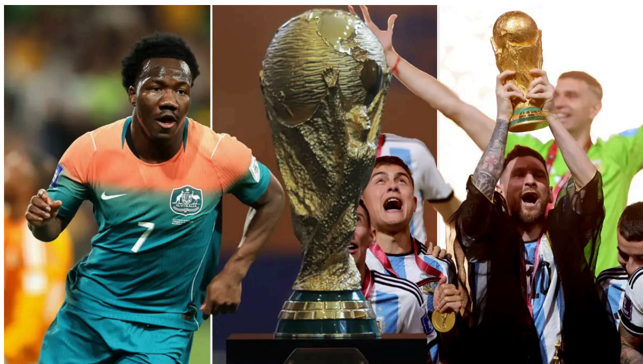
📷 Nestory Irankunda looms as a breakout star for the World Cup as Lionel Messi, right, attempts to lead Argentina to victory again.

All of Australia's matchups are situated on the west coast of North America. The Socceroos will start in Vancouver, Canada, for their game against Turkey, then head to the United States.